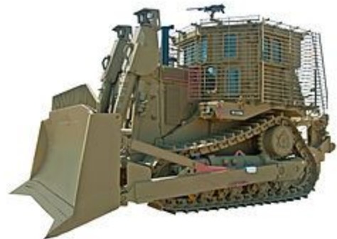
Armored Caterpillar D-9 Bulldozer